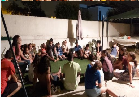
Workshop on Healthy Adolescence

Two weeks of camping at our house in Queijas, first week: 20 kids; second week: 22 teenagers