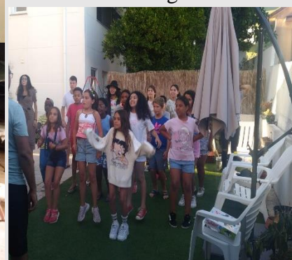
Serving the Good News Channel (Youtube channel on Children evangelismo)