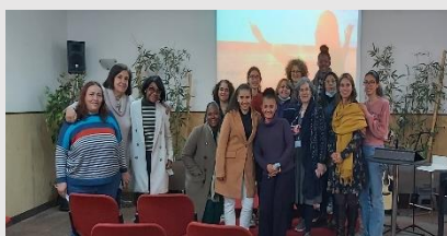
The Impressive Chapel of Bones